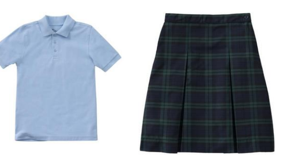
Poindexter's Uniform Plaid Wrap Skort