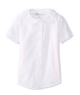
Poindexter's Uniform White Peter Pan Blouse (may only be worn under jumper)